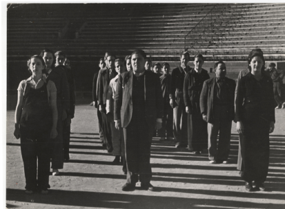
Gerda Taro, [General mobilization, Valencia], March 1937. Gift of Cornell and Edith Capa, 2002 (532.2002). Courtesy International Center of Photography.