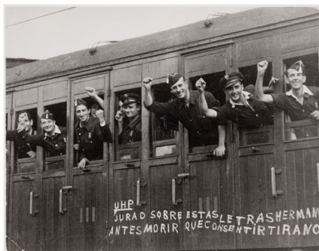
Robert Capa, [Republican soldiers saluting through the windows of their departing train, Barcelona, Spain], August, 1936.