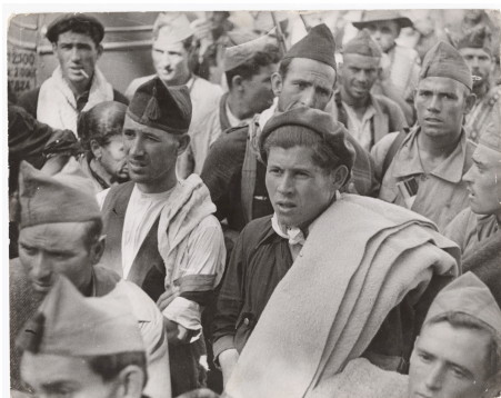
Robert Capa, [Crowd of Republican soldiers listening to a speech, Córdoba front, Spain], August-September 1936. The Robert and Cornell Capa Archive, Gift of Cornell and Edith Capa, 1992 (709.1992).