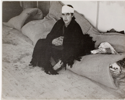
Robert Capa, [Refugee woman from Malaga with bandaged head sitting on bundles of her belongings, Almeria, Spain], February 1937. The Robert Capa and Cornell Capa Archive, Gift of Cornell and Edith Capa, 1992 (900.1992).