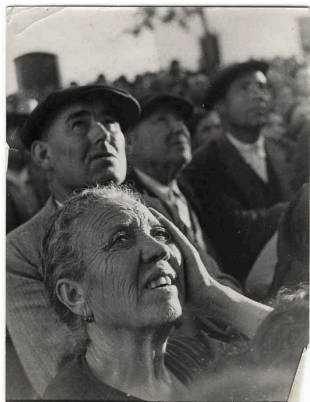
Chim (David Seymour), [Old woman at a land reform meeting, near Badajoz, Estremadura, Spain], 1936. Gift of Eileen and Ben Shneiderman (466.1982). © David Seymour / Magnum Photos