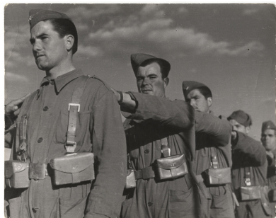
Gerda Taro, [Training of the New People's Army, Valencia, Spain], March 1937. Gift of Cornell and Edith Capa, 2002 (417.2002).