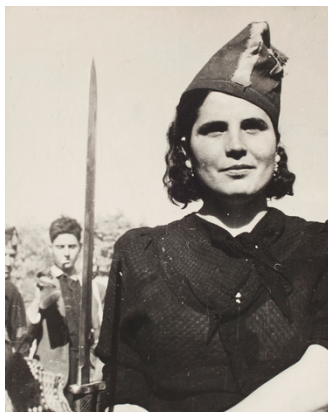
Robert Capa, [Militiawoman, near Barcelona], August 1936. Gift of William Piel, 1994 (574.1994).