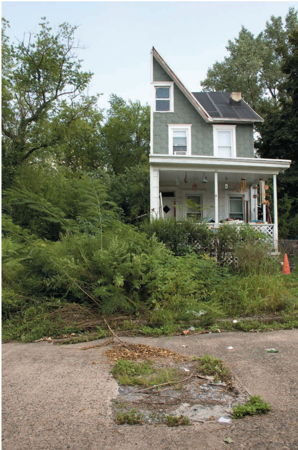
Zoe Strauss, Half House, Camden, NJ, 2008. Courtesy the artist.