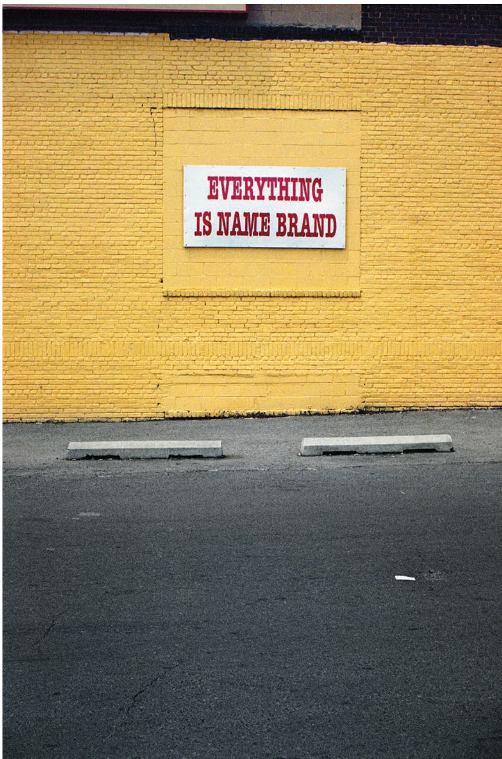
Zoe Strauss , Everything Is Name Brand , Philadelphia, 2003. Courtesy the artist.