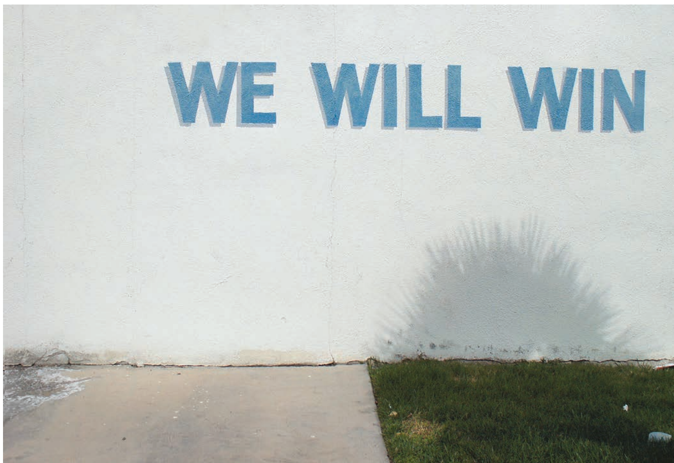
Zoe Strauss , We Will Win , Las Vegas, 2004. International Center of Photography, Purchase, with funds from the ICP Acquisitions Committee, 2013.