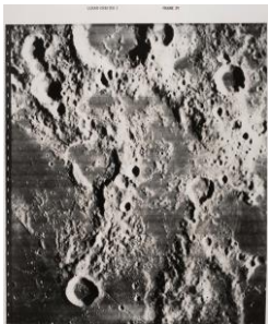
NASA, Lunar Orbiter 1, Frame 29, August 18-29, 1966. International Center of Photography, Gift of Christopher Phillips, 2010 (2010.16.2)