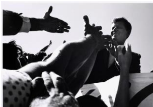
Cornell Capa, John F. Kennedy shaking hands, Michigan, September 5, 1960. International Center of Photography, The Robert Capa and Cornell Capa Archive, Gift of Cornell and Edith Capa, 2004 (107.2004)