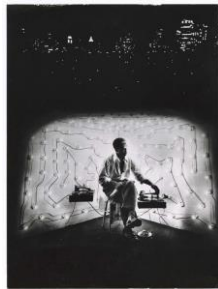
Gordon Parks, Invisible Man Retreat, Harlem, New York, 1952. International Center of Photography, The LIFE Magazine Collection, 2005 (1606.2005)