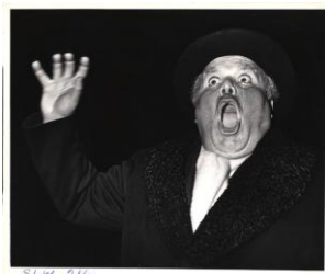
Peter Bull as Russian Ambassador Alexi de Sadesky on the set of Dr. Strangelove or: How I Learned to Stop Worrying and Love the Bomb, 1963.