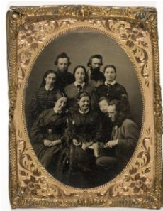
Unidentified photographer, Unidentified Family Group with Tinsmith, ca. 1865. International Center of Photography, Museum Purchase, 2008 (2008.57.4)