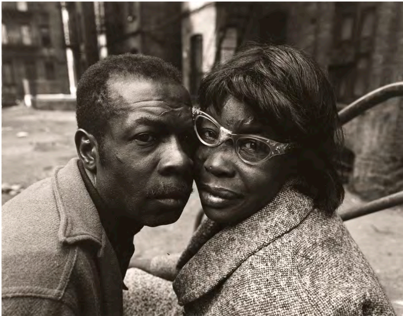
Bruce Davidson, East 100th Street, New York City, USA , c. 1970.