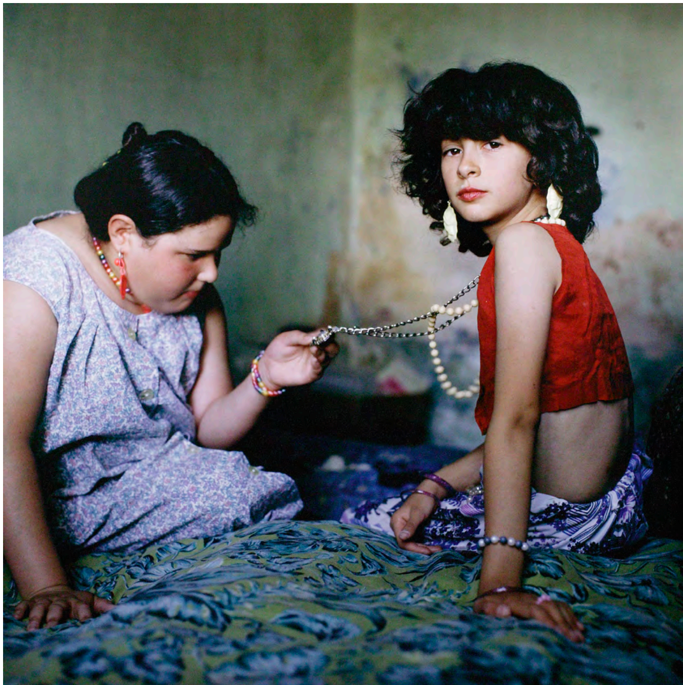
Alessandra Sanguinetti, The Necklace , 1998–2002.