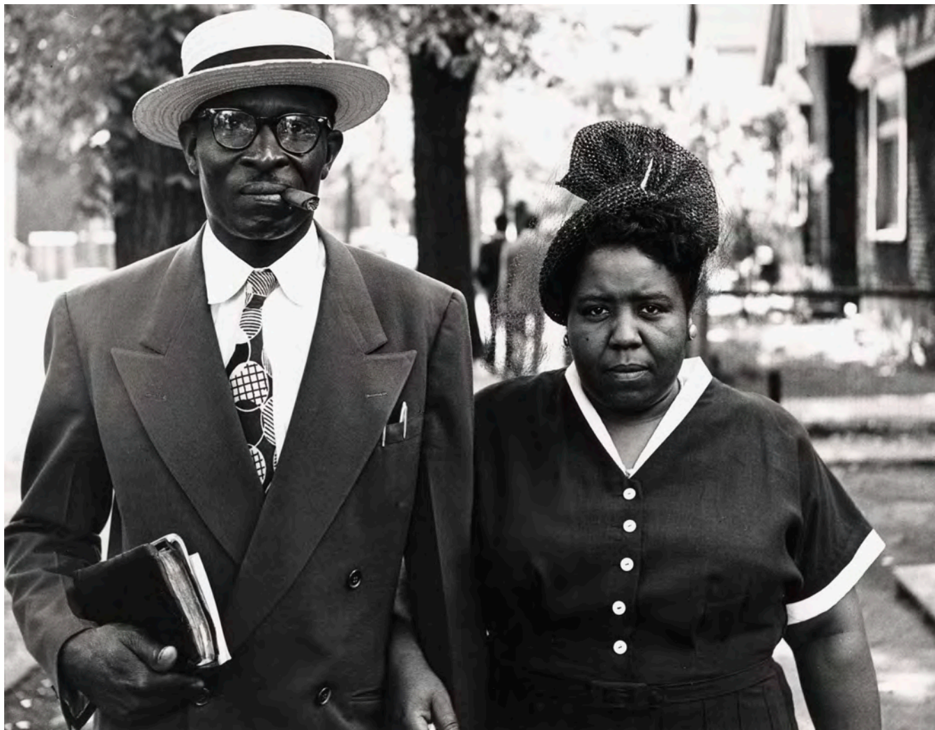
Gordon Parks, Husband and Wife , Sunday Morning , Fort Scott, Kansas, 1949.