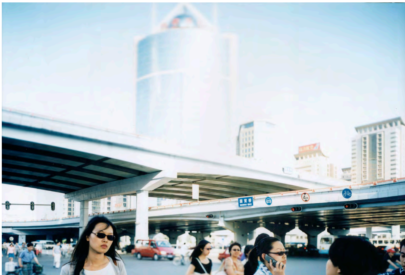
Olivo Barbieri, Beijing , 2001.