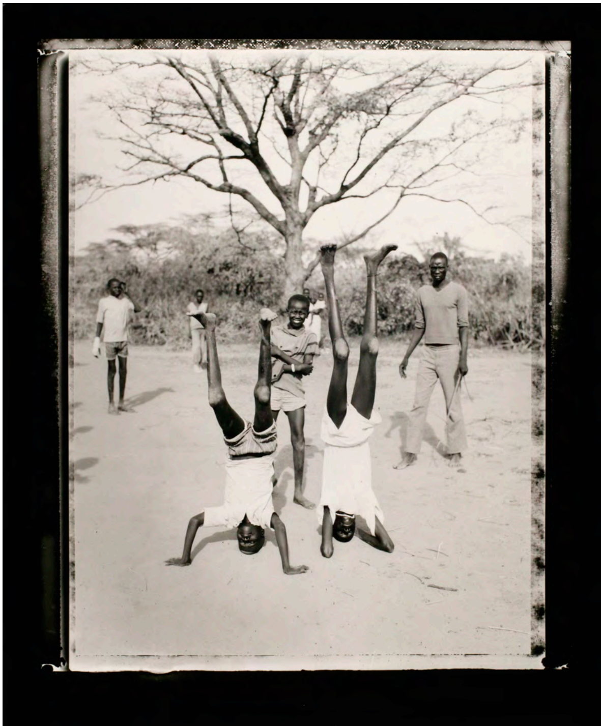
Fazal Sheikh, Unaccompanied minors, Sudanese Refugee Camp, Kakuma, Kenya, 1993.