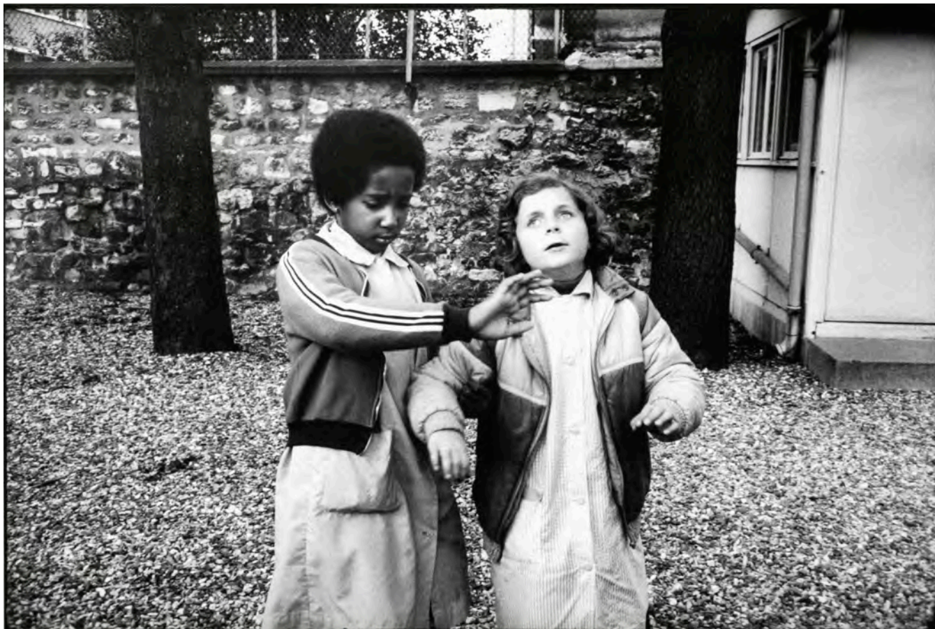
Jane Evelyn Atwood, Institute of Education for the Senses, Denfert Rochereau, Paris, France, 1980.