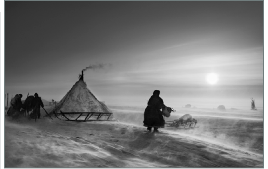
Sebastião Salgado, Inside the Arctic Circle, Yamal Peninsula, Siberia, Russia , 2011. © Sebastião Salgado/ Amazonas images—Contact Press Images.

"We must act now to preserve unspoiled land and seascapes and protect the natural sanctuaries of ancient peoples and animals."