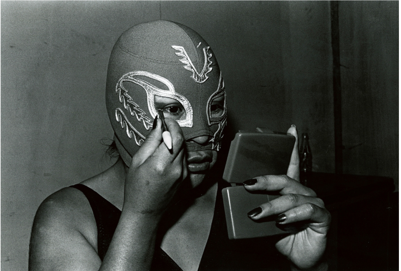
Lourdes Grobet, Double Wrestle III (La doble lucha III) , 1981–82, gelatin silver print. Collection Leticia and Stanislas Poniatowski. © Lourdes Grobet.