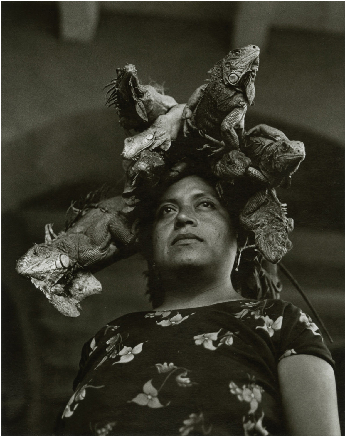
Graciela Iturbide, Our Lady of the Iguanas (Nuestra Señora de la Iguanas) , Juchitan, Oaxaca, 1979, Gelatin silver print. Collection Leticia and Stanislas Poniatowski. © Graciela Iturbide.